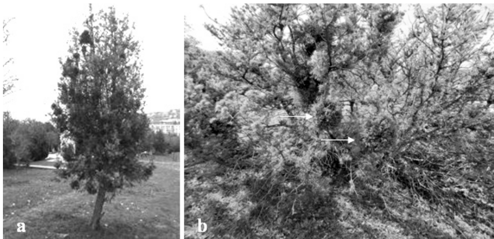
Fig. 1. Arceuthobium oxycedri on Juniperus deltoides in the South-Western Crimean Foothills: a — Sevastopol, Fraternal (Bratskoe) Cemetery; b — Mount Zybuk-Tepe between Ternovka and Rodnoye villages, Balaklava District of Sevastopol