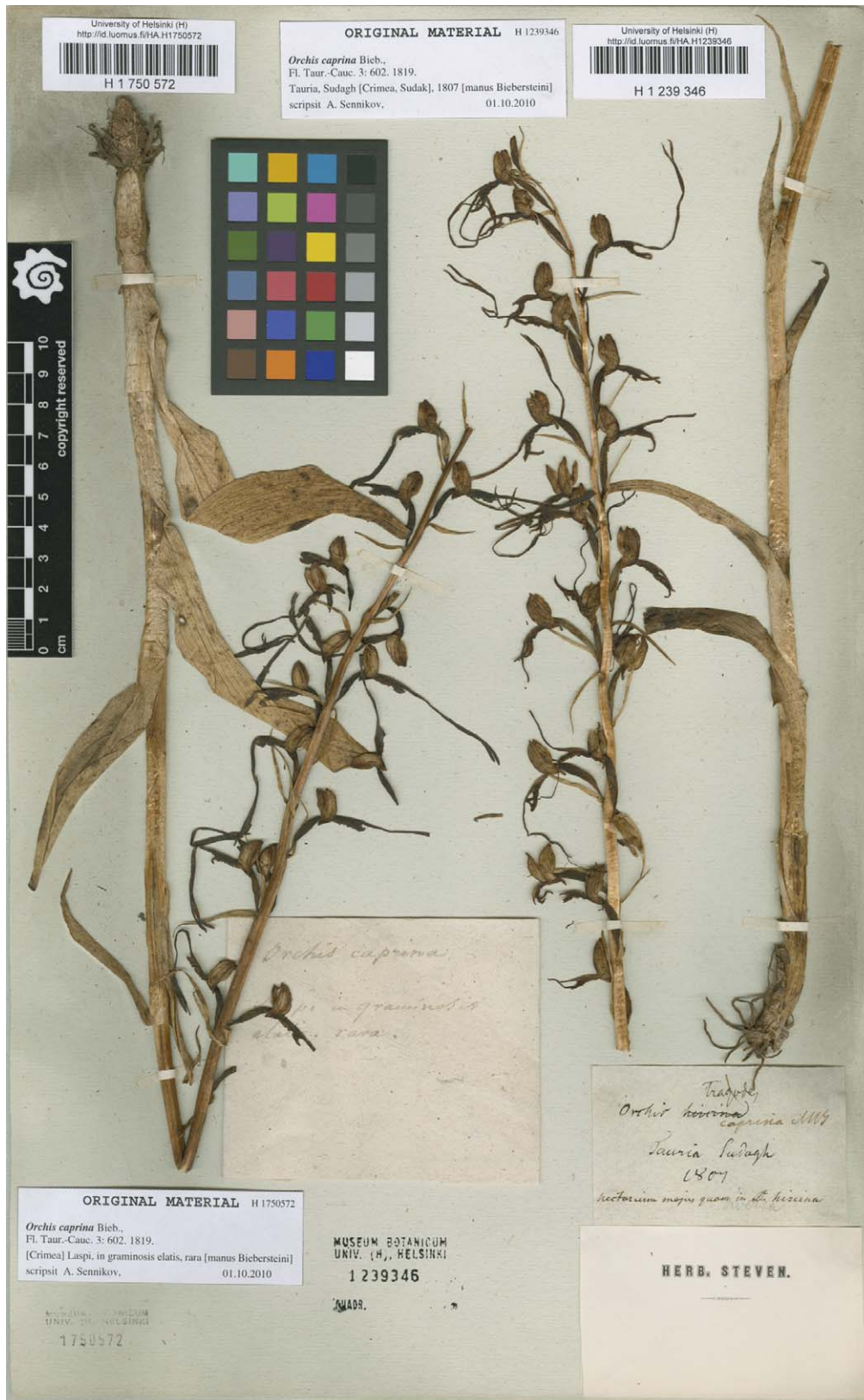
FIGURE 3. Lectotype of Himantoglossum caprinum (right-hand specimen, H 1239346).

These analyses demonstrate (i) the value of these quantitative traits in separating the “spotted” and “unspotted” species, (ii) that the names H. caprinum and H. affine refer to the same “unspotted” species (as typified below); and that consequently (iii) a new name (to be published in our forthcoming paper) must be applied to the “spotted” species that is distributed across the eastern Mediterranean from the Balkans to Asia Minor.